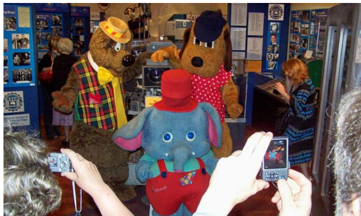
Some colour was added to official proceedings with appearance of station mascots Humphrey Bear, Flapper and Dooper Dog