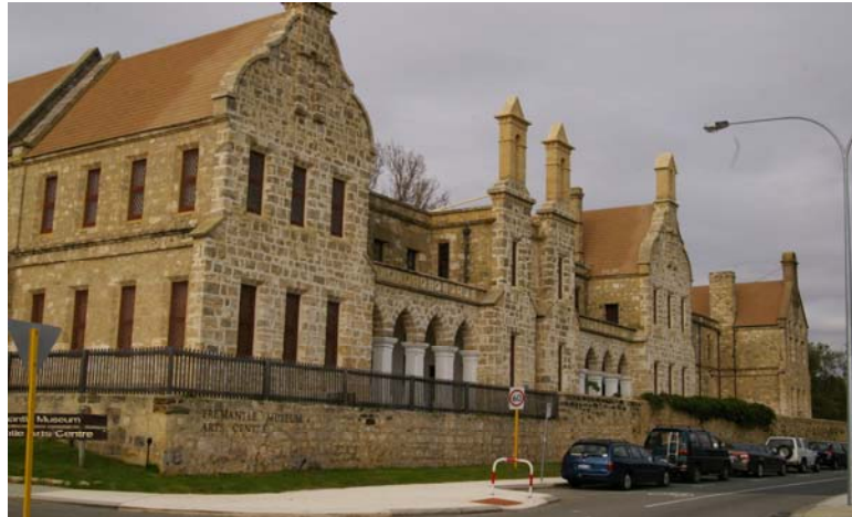
The Fremantle Arts Centre

The Exhibition was presented in the convict built and heritage listed Fremantle Arts Centre, Finnerty Street, Fremantle. The building, originally designed as a lunatic asylum, had until recently housed the Fremantle History Museum. The free exhibition was open to the public every day from 10 am to 4 pm between October 5 th and December 6 th .