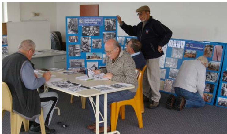
Part of the project team selecting photos for display

The event cost $18,500 to stage, of which a total of $5,000 was provided by the main sponsors, the City of Fremantle and ScreenWest. The balance was provided by other contributions and donations during the event. A significant value was placed on the contribution of volunteer labour and materials.