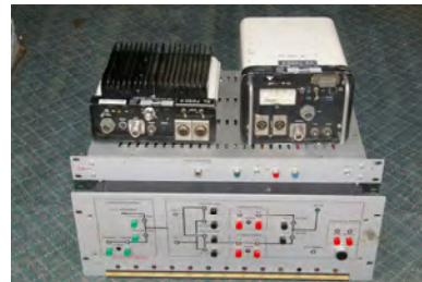
Left: Equipment selected for AMMPT collection.