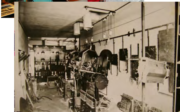
Installing the first silent Simplex equipment in the bio box